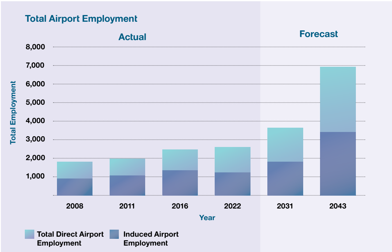
Figure 3.2: Actual and expected case forecast total Employment 2008 – 2043: Source: Hudson Howell.